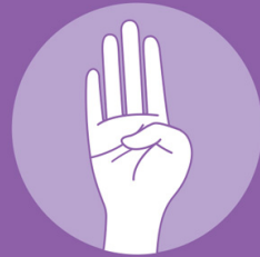
1. Palm to camera and tuck thumb