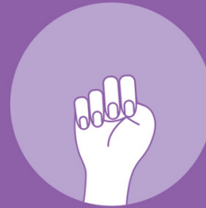
2. Trap thumb